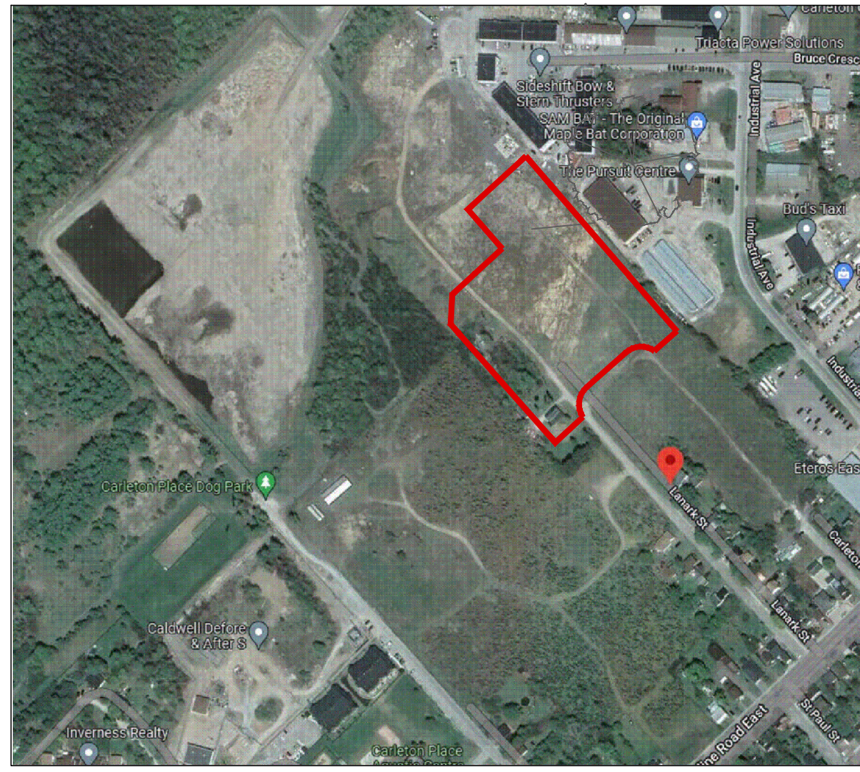
Key Plan N.T.S.