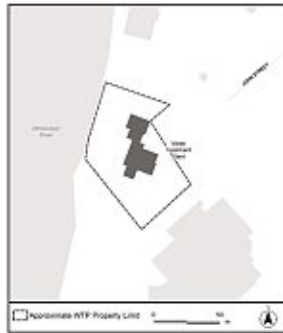
Figure 1: Water Treatment Plant Expansion Footprint

Based on the findings of this Class EA study, the Preferred Design involves expanding the WTP with new concrete tank filters, including new filter backwash and backwash water reserve tanks. The new concrete filter tanks would be sized to treat the full capacity of the plant. Existing steel tank filters will be decommissioned and abandoned in place after new concrete tank filters would be operational. It also seeks to maintain use of the existing processes, including the existing raw water intake, Actiflo clarifiers, and clearwells, while providing new infrastructure where necessary to increase treatment capacity to accommodate the future growth. It will also preserve the original 1914 Carleton Place Waterworks building which can continue to be used for chemical storage, maintenance activities and administrative purposes.